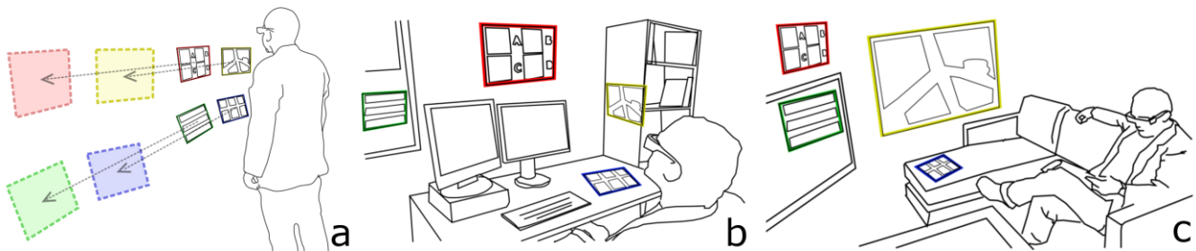
Figure 1. Transitions of application window layouts to world-fixed coordinates are derived from a common body-centric layout (a). This approach maintains relative spatial consistency while integrating application layouts into diverse surroundings (b, c).

2 Microsoft Research Redmond, WA eyalofek@microsoft.com